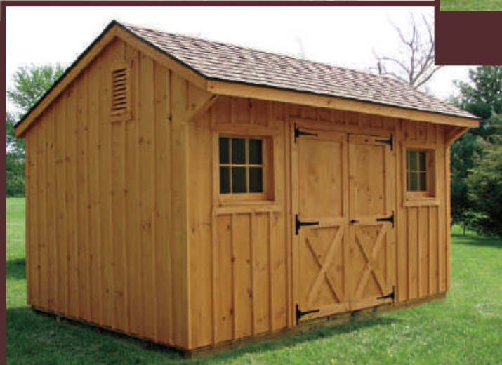
10'X16' QUAKER STORAGE SHED