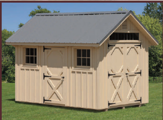
8'X12' GARDEN STYLE STORAGE SHED | stained with metal roof

Our buildings feature extra 2x6 rafter plates.