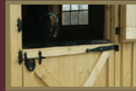
4'x7' Dutch Doors Include heavy duty powder coated strap hinges & decorative hardware.