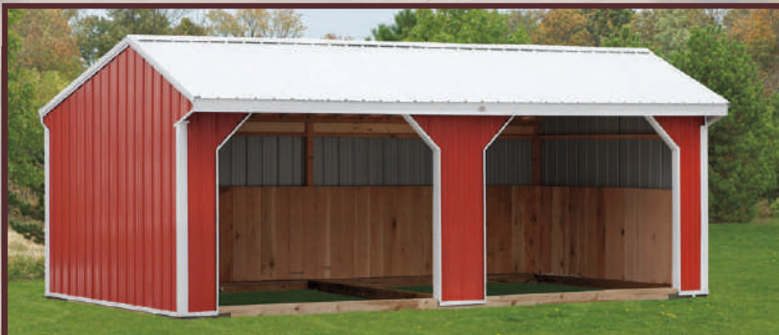
12'X24' RUN-IN SHED | metal siding and metal roof