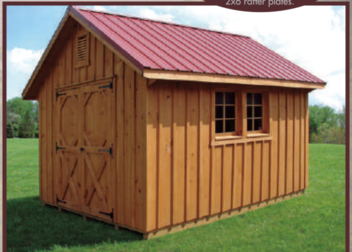
10'X12' GARDEN STYLE STORAGE SHED stained with metal roof