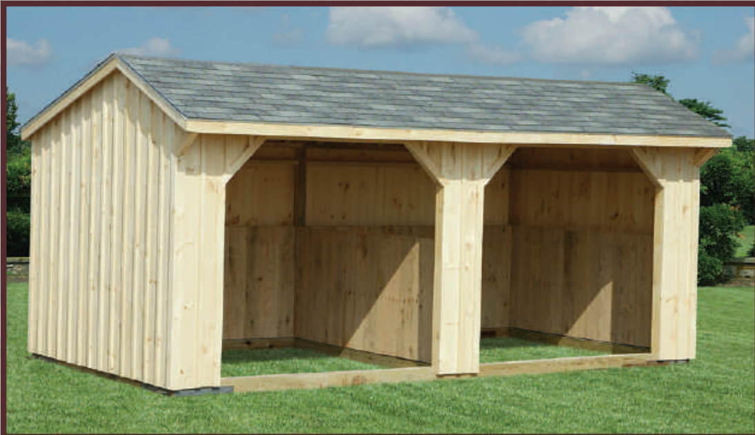
10'X20' RUN-IN SHED | with center divider