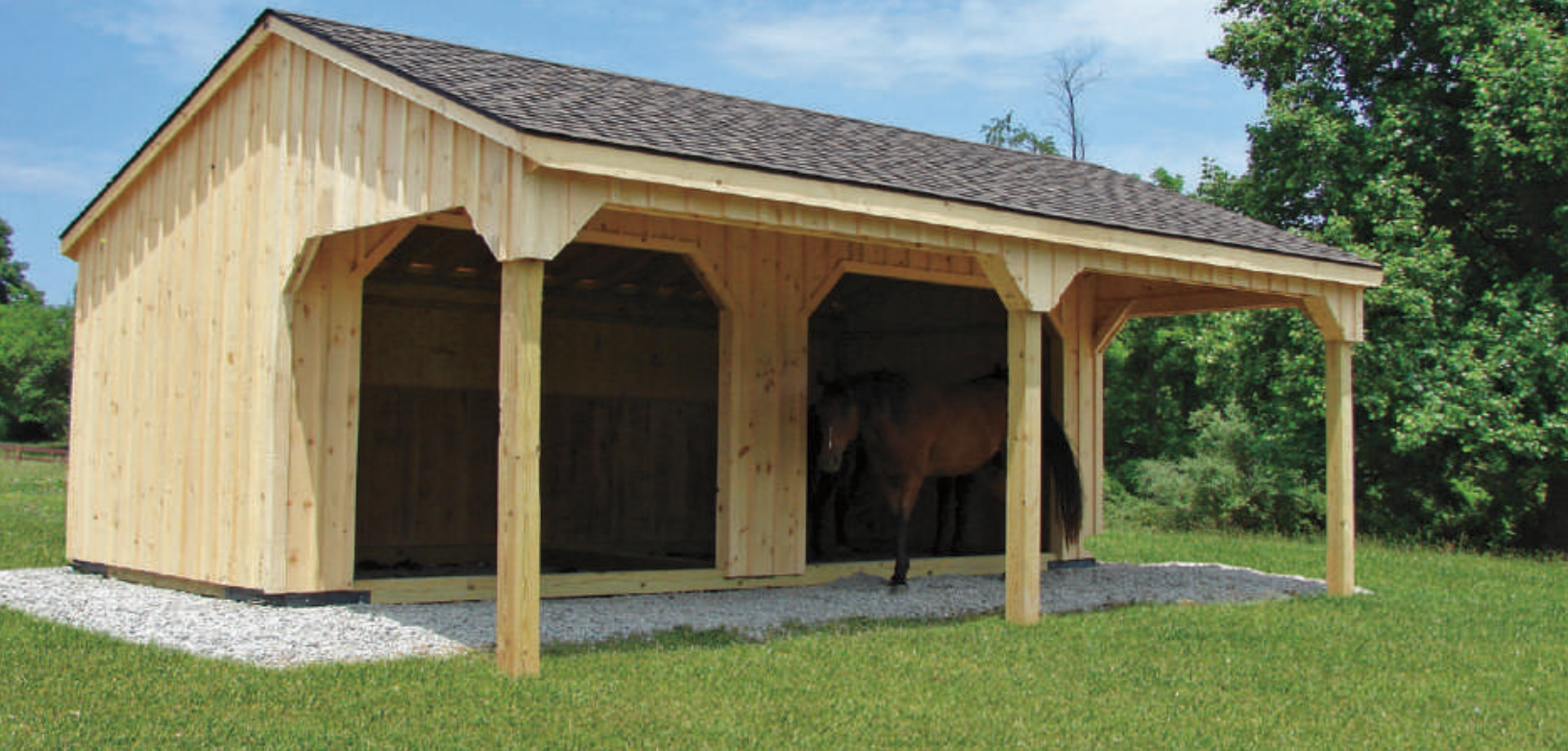
10'X24' RUN-IN | with 8' overhang