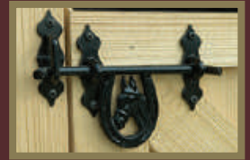
Decorative Horse Latch