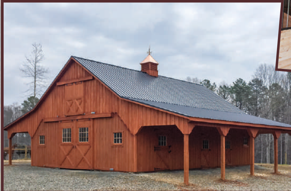
30'X40' | with hayloft and two 10' overhangs