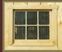
Wooden 6 Lite Window