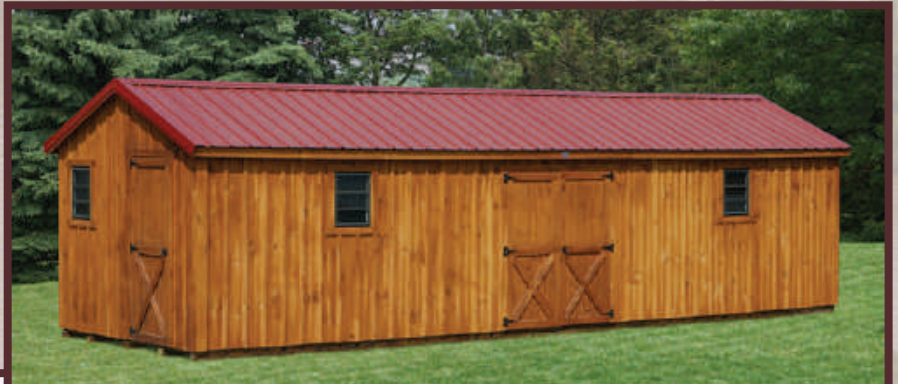
10'X32' A-FRAME STORAGE SHED | stained & red metal roof