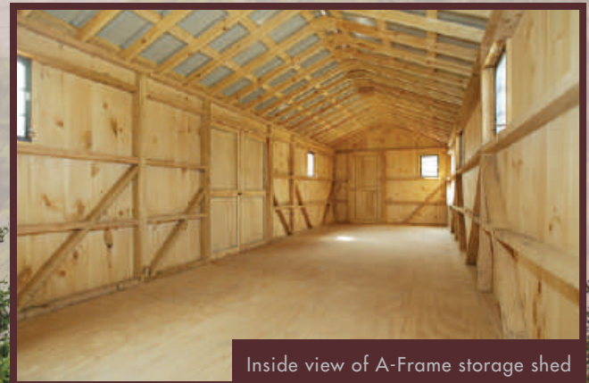
Inside view of A-Frame storage shed