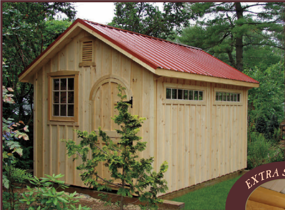
10'X16' GARDEN STYLE STORAGE SHED transom window, metal roof and arched door

feature 10" overhangs and a steeper roof pitch