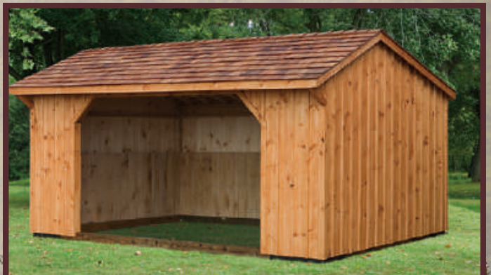
10'X18' RUN-IN SHED | stain & cedar shake shingle roof