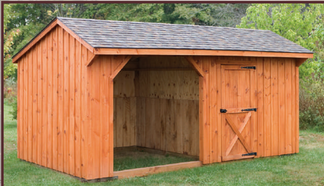
10'X20' RUN-IN / TACK ROOM | optional stain