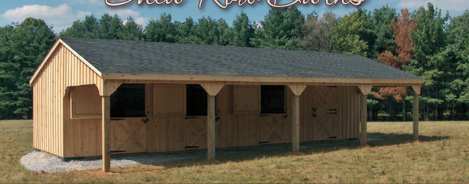
12'X40' SHED ROW | with 10' overhang