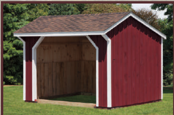
10'X12' RUN-IN SHED | red stain with white trim