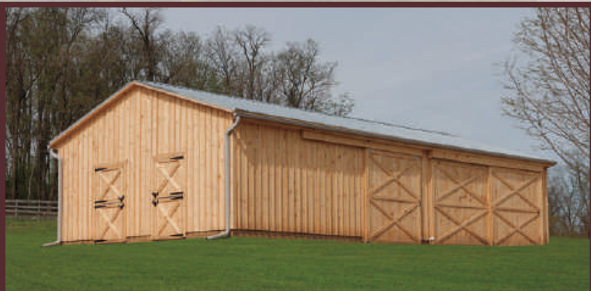
24'X48' BARN | with two horse stalls and storage