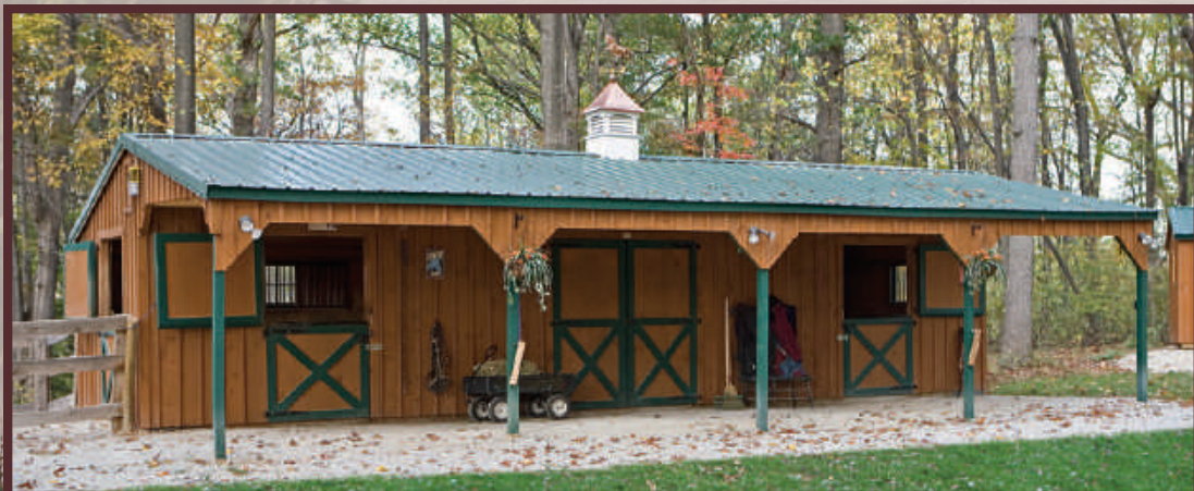
12'X40' SHED ROW | stained and metal roof