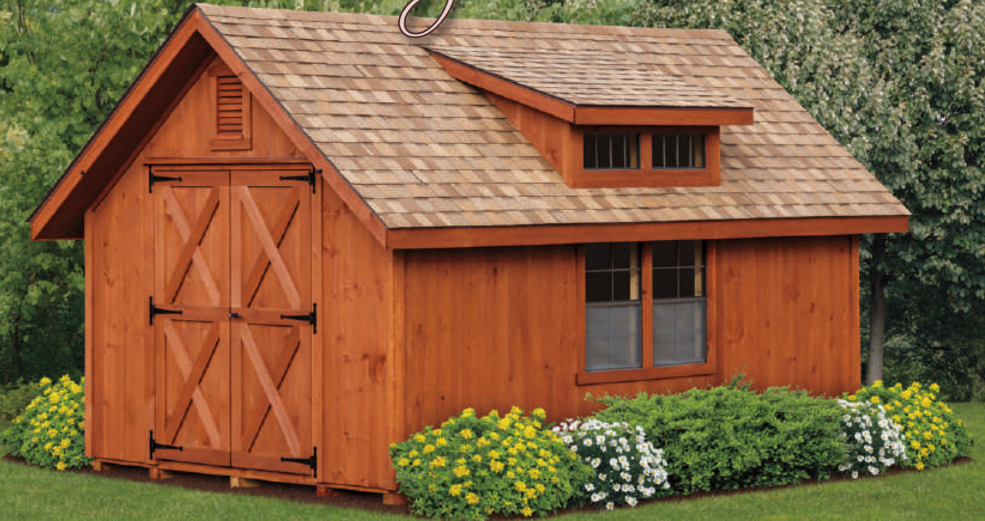
10'X16' VICTORIAN COTTAGE | stained & shingle roof