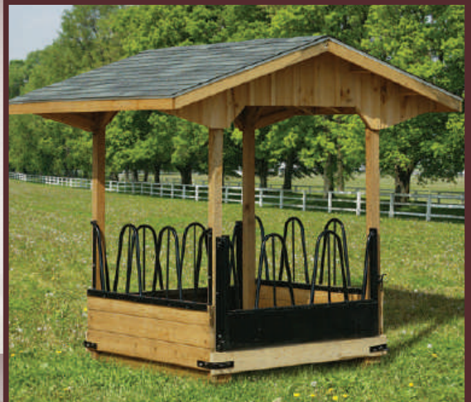
6'X10' HAY FEEDER | Easy to move hay feeder features powder coated corner brackets