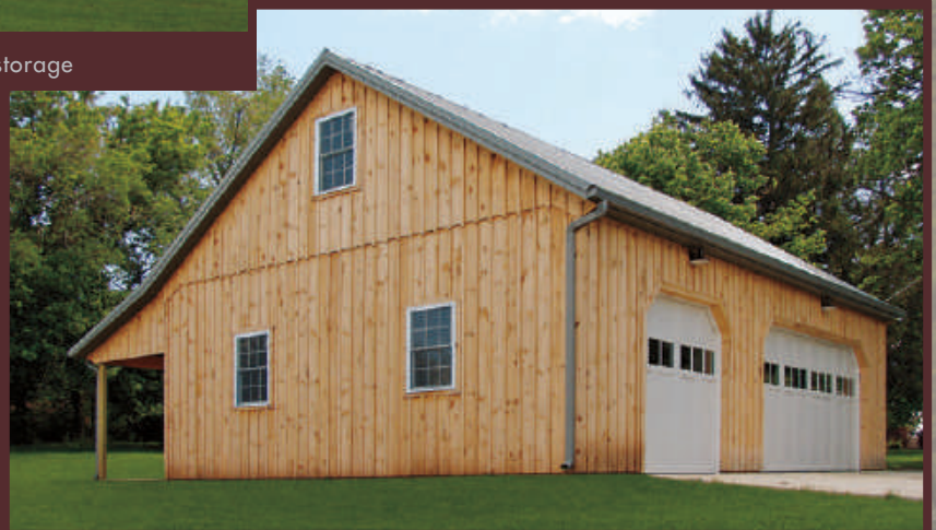
28'X40' GARAGE | with 8'x10' porch